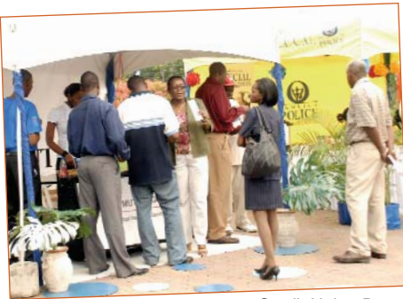
Credit Union Day at CUNA Mutual booth.