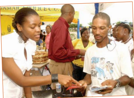
CUNA Mutual staff engaging members at the Credit Union Day Financial Fair at Emancipation Park, October 16, 2009.